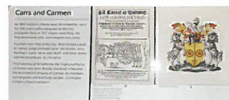
The new Carman display at the entry to the first London Transport Museum gallery.