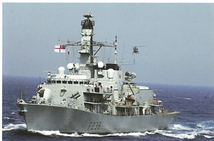
HMS Northumberland replaces the decommissioned HMS Cardiff as the third warship associated with the Company. First was HMS Anson in 1946.