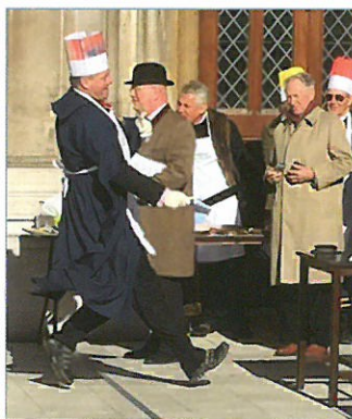
The Master Carman wins the Inter-Livery Pancake Race on Shrove Tuesday in Guildhall Yard.